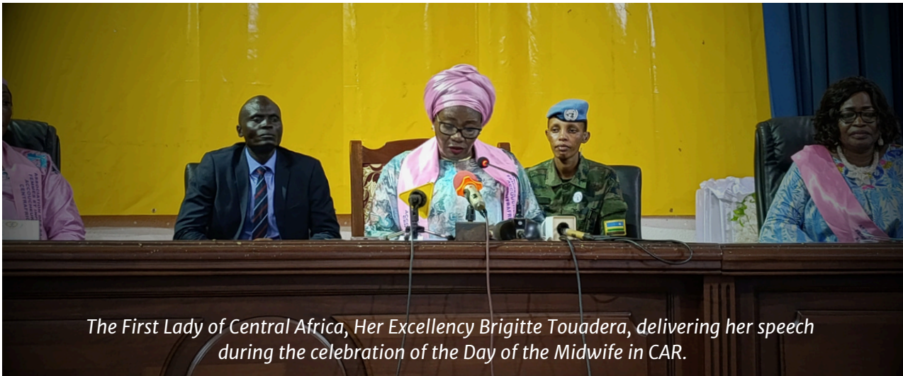
The First Lady of Central Africa, Her Excellency Brigitte Touadera, delivering her speech during the celebration of the Day of the Midwife in CAR.