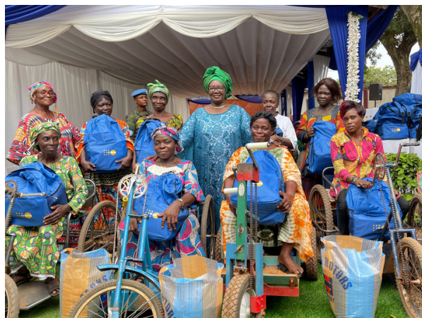
The First Lady of the CAR, H.E. Mrs. Brigitte Touadera, with women living with disabilities.

The First Lady, known for her commitment to women's issues, emphasized the importance of these days for raising public awareness about the specific challenges these women face and for strengthening efforts aimed at their empowerment.