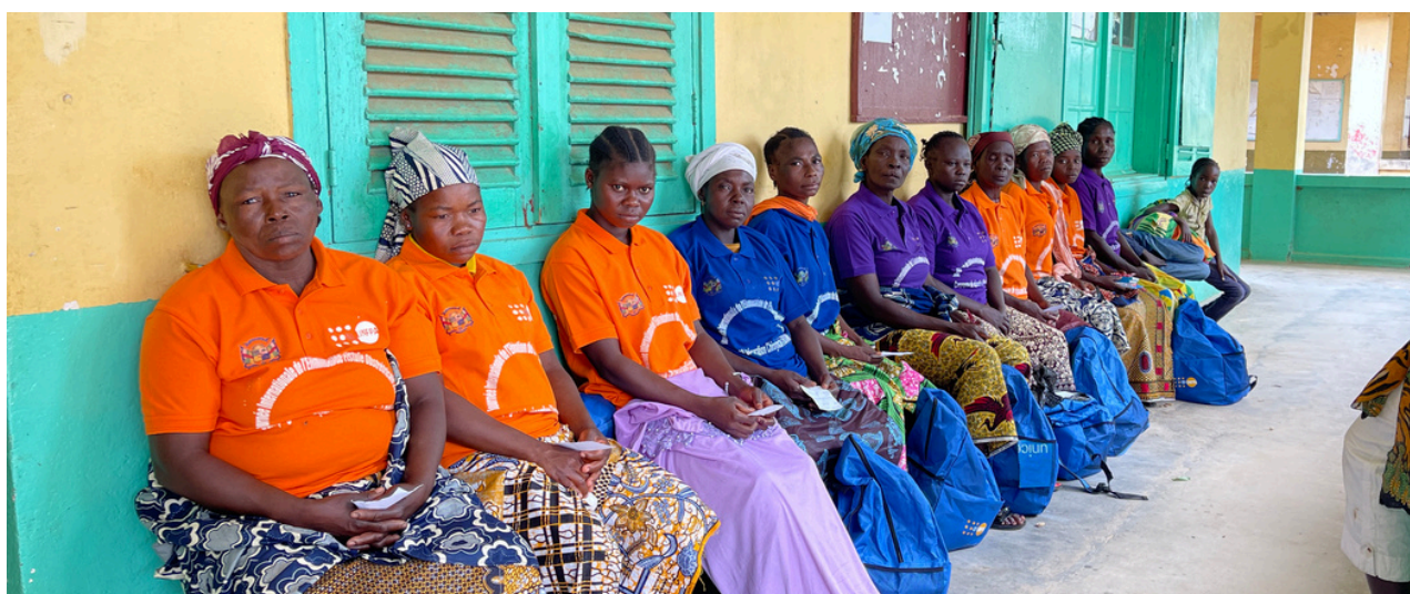
With the support of UNFPA, these women hope to live normal lives after undergoing their obstetric fistula surgeries.

Women with confirmed cases of obstetric fistula who are to undergo surgical interventions as part of the campaign, attended the brief ceremony, where they received dignity kits to help maintain personal hygiene for their health and well-being. These dignity kits contain items such as soap, towels, toothbrushes, toothpaste, hand sanitizers, and underwear, among other essentials.