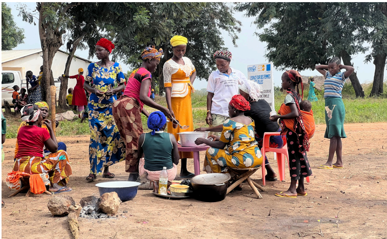
Women from the safe space in Boukaya (Northwest CAR) selling their food products.

In the locality of Boukaya, in the northwest of the Central African Republic, the challenges faced by women and girls are exacerbated by the persistence of armed conflicts and chronic insecurity. Gender-based violence is a daily reality for many, and access to safe and viable economic resources is often out of reach.