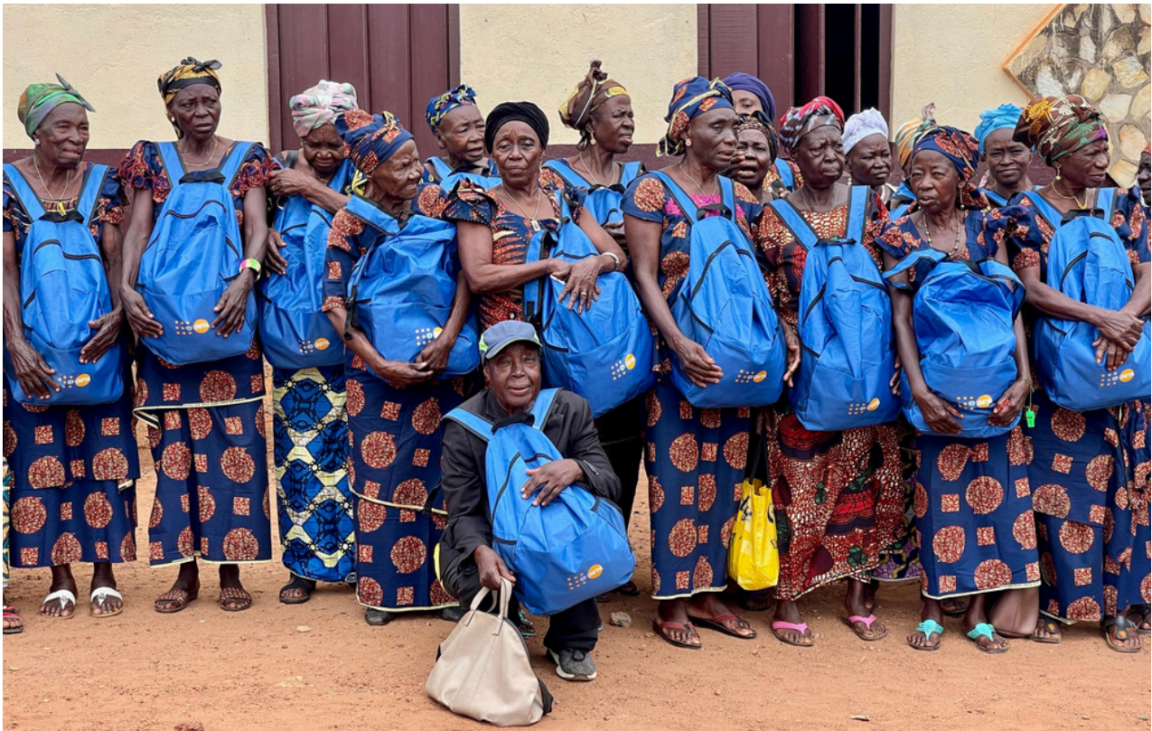
Some members of the Zarephath Widows Association with their dignity kits.

Following the launch, H.E. Mrs. Brigitte Touadera welcomed women and girls who are members of women's organizations, widows, and the Movement of GBV Survivors of Central Africa (MOSUCA), as well as Muslim women, working women, and women living with disabilities, for a ceremony designed to provide a platform for discussing actions to eliminate domestic violence and sexual violence related to conflicts. The event, held at the secretariat of the 'Cri de coeur d'une mère' Foundation, also served as an occasion to distribute dignity kits to the women and girls in attendance.