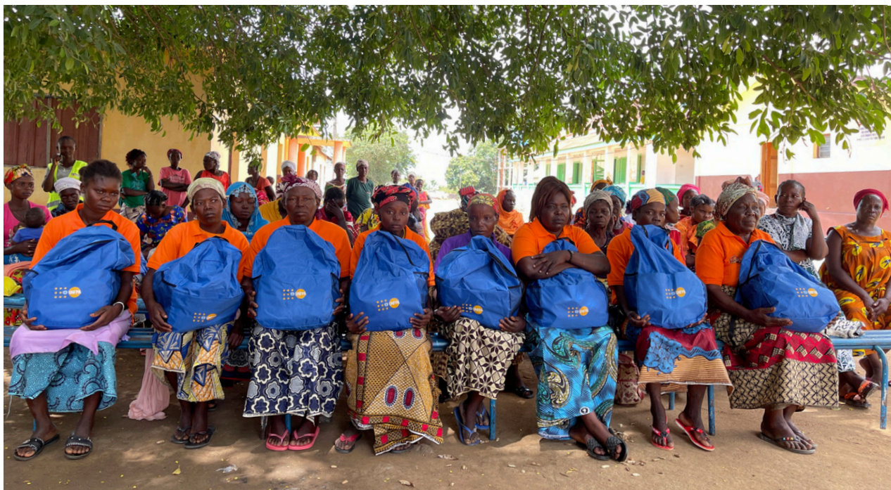
The beneficiaries scheduled to undergo obstetric fistula repair surgeries holding their dignity kits.

A campaign for obstetric fistula repair has been launched in Bouar, marking a significant step in the fight against Obstetric Fistula (OF); the devastating medical condition which robs victims of the health, wellbeing and dignity in society. The event, presided over by the Prefect of Nana Mambéré, brought together government representatives, local authorities, healthcare professionals, and development partners in support and solidarity for the health campaign aimed at restoring dignity to OF victims.