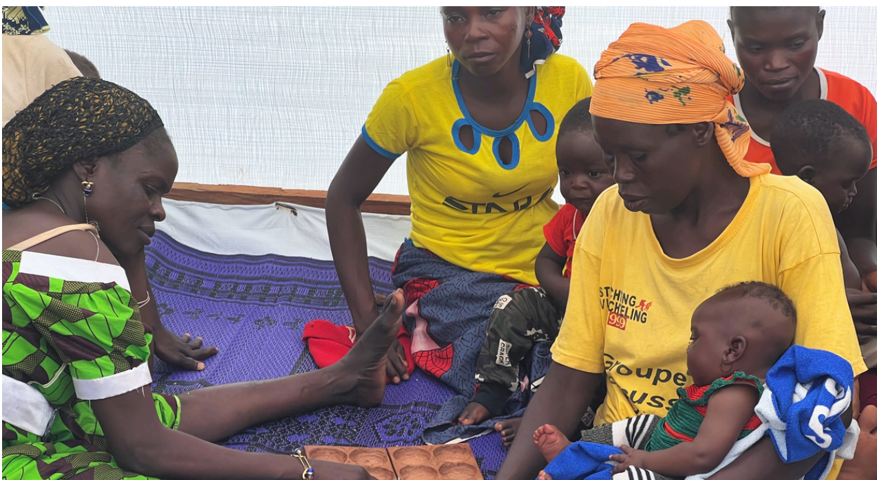
Women from the Boukaya safe space (Northwest CAR) playing kissoro.

To intensify this impact, the project deploys an integrated service offering, carried out in collaboration with the NGO, Alliance for International Medical Action (ALIMA), to ensure comprehensive medical care. This multidisciplinary strategy aims to achieve UNFPA's 3 Transformative Results: zero preventable maternal deaths, zero unmet needs for family planning, and zero gender-based violence and harmful practices. It also includes the prevention and treatment of sexually transmitted infections (STIs) and HIV, as well as the prevention of early and unwanted pregnancies often resulting from sexual assault. By integrating SRH services with GBV prevention and response, this program ensures holistic care that respects and enhances the dignity and resilience of the women and girls of Boukaya.