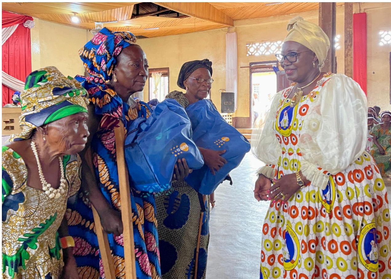
The First Lady of the Central African Republic, Her Excellency Mrs. Brigitte Touadera, handing out dignity kits to widows.

In June, the Central African Republic marked two important international days for women's empowerment: the International Day for the Elimination of Sexual Violence in Conflict (June 19) and the International Widows' Day (June 23). Against this background, the United Nations Population Fund (UNFPA) organized an awareness session on the family cohesion and other topics related to these two days.