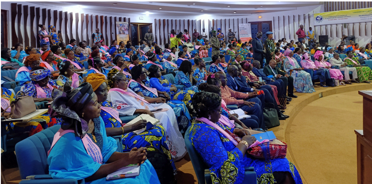
Midwives celebrate International Midwives Day under the high patronage of the First Lady of the Central African Republic, Her Excellency Brigitte Touadera.

The Central African Republic joined the global community in celebrating International Midwives Day (IMD) on Monday, May 6, 2024, in the CEMAC hall in Bangui. The event, organized under the high patronage of the First Lady of the Central African Republic, Her Excellency Brigitte Touadera, highlighted the crucial role midwives play in ensuring the health of mothers and newborns.