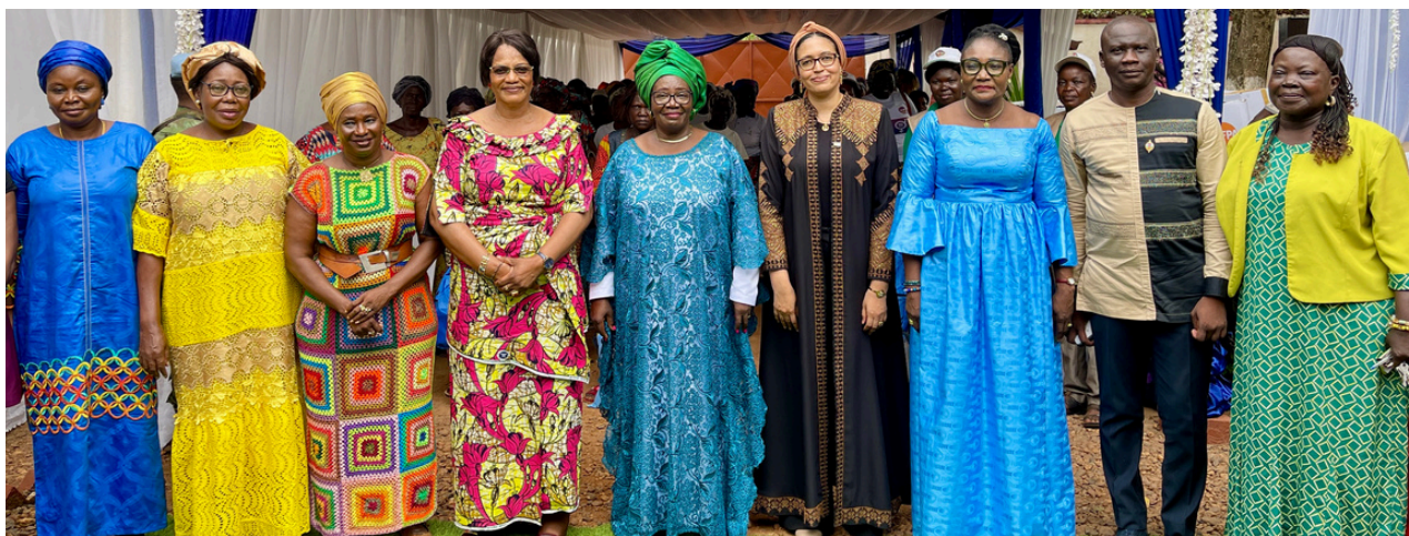
Group photo of the First Lady of CAR with the distinguished guests at the ceremony.