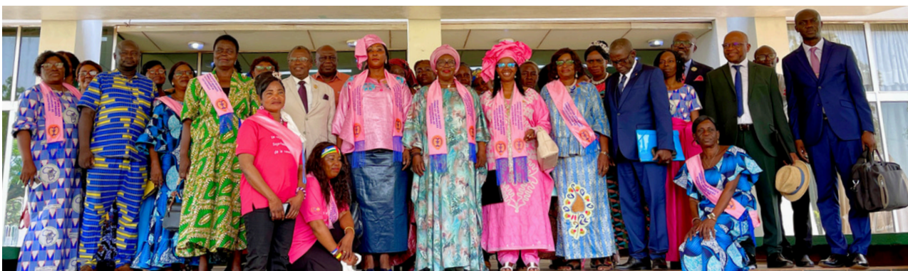
Group photo with the First Lady of CAR, Her Excellency Brigitte Touadera, during the celebration of International Midwives Day.

The celebration of International Midwives Day in the Central African Republic highlights the essential role midwives play in building a healthier future for mothers and children. With continued support and investment, midwives can play a powerful role in improving maternal health outcomes in the country.